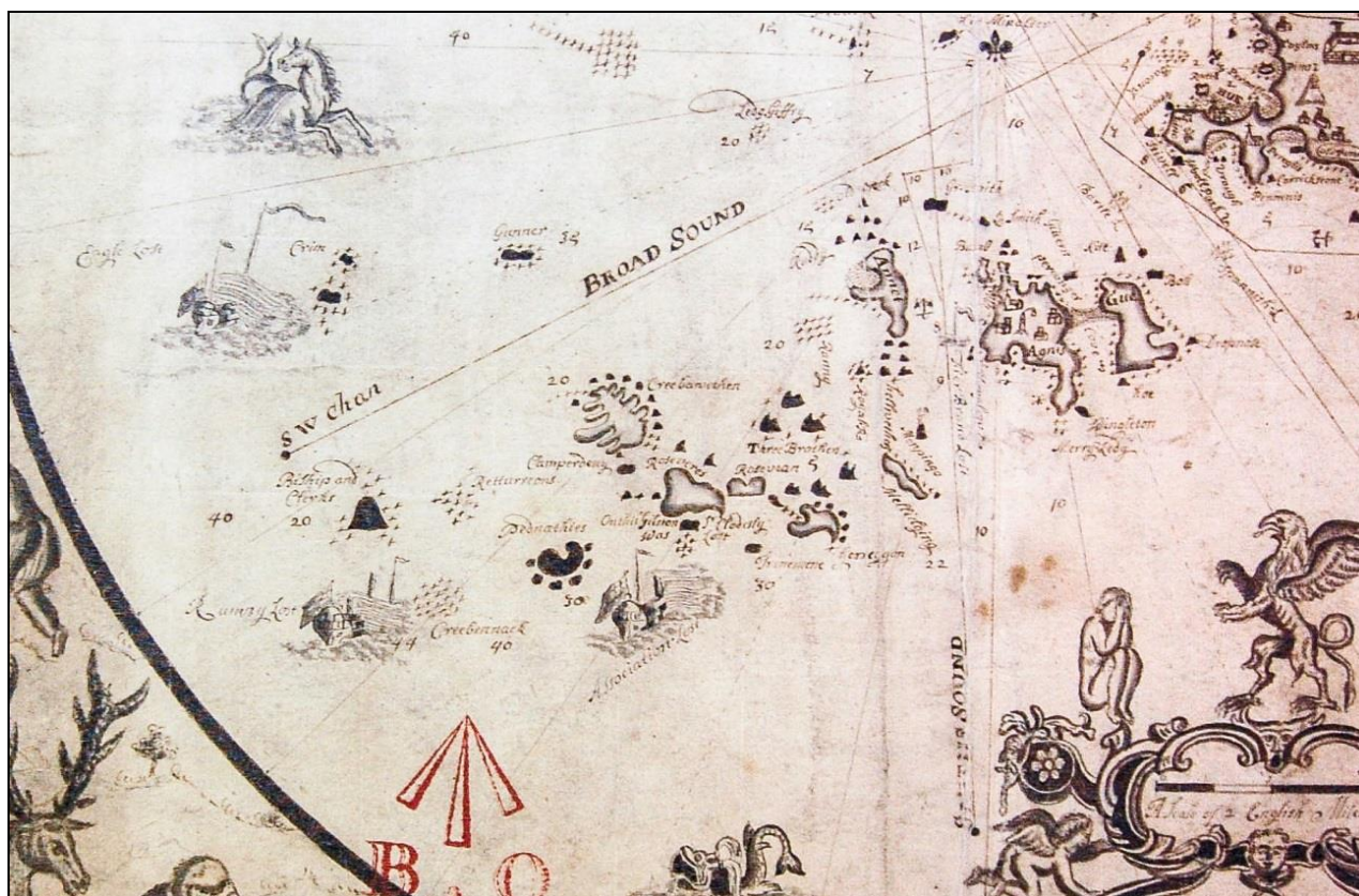
Fig 2 Detail from Edmund Gostelo's c 1708 chart (The National Archives MPH1/368).