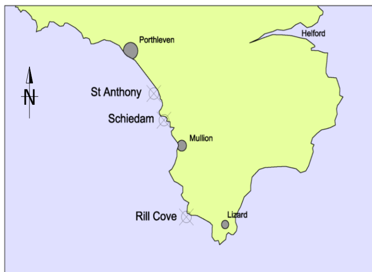
Fig 1. The location of the St Anthony, Schiedam and Rill Cove sites on the west coast of the Lizard peninsula.

The site is situated on the west coast of the Lizard peninsula in west Cornwall. It lies in shallow water a few metres from the cliff face; the centre of the Rill Cove designated area is given on the statutory instrument (designation No 1) 1976 No. 203 as 67751345 on the 6" to 1 mile Ordnance Survey Map, sheet SW 61 SE. The current designated area is a circle, centred on the above position, with a radius of 100m.