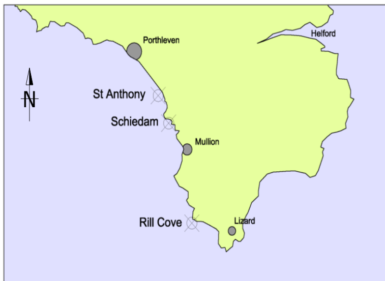
Fig 1. The location of the St Anthony, Schiedam and Rill Cove sites on the west coast of the Lizard peninsula.

The site is situated on the west coast of the Lizard peninsula in west Cornwall. It lies in shallow water a few metres from the cliff face; the centre of the Rill Cove designated area is given on the statutory instrument (designation No 1) 1976 No. 203 as 67751345 on the 6" to 1 mile Ordnance Survey Map, sheet SW 61 SE. The current designated area is a circle, centred on the above position, with a radius of 100m.